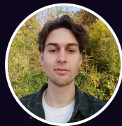
Kai Hähnle Engineering