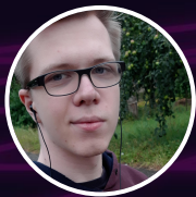
Elias Kittel Engineering