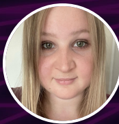
Laura Eppler Graphics