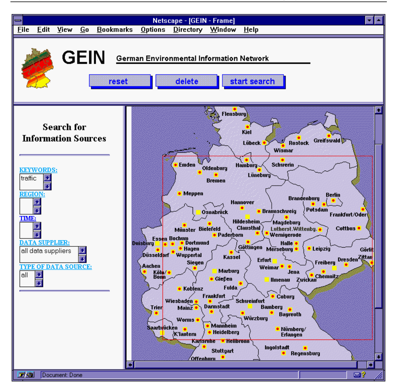
Figure 1: The Information Locator developed for the prototype of the German Environmental Information Network and the Environmental Information System Baden-Württemberg. Sources of information can be searched for by specifying various search criteria. Geographical references may be entered and processed by using a Gazetteer (Riekert et al. 1997).